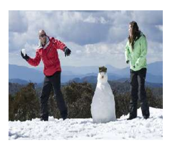
5Days-4Nights MELBOURNE/MT BULLER SNOW MOUNTAIN/GREAT OCEAN ROAD ADVENTURE